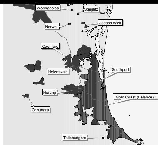
Figure 19.1 Location of the Southport TRC

Table 19.3 shows the number of trips that were chartered from the Southport TRC over the previous year and the percentage that were chartered primarily for fishing. Most charters from the Southport TRC were day trips (3,084 days), and similarly to the Queensland average, most day trips were fishing charters. All overnight trips (120 days) were fishing charters, and 59.6% of extended trips were fishing-only.