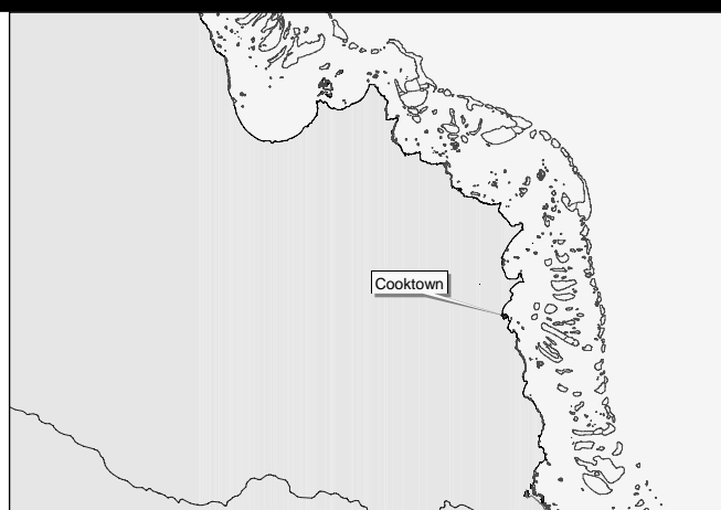
Figure 9.1 Location of the Cooktown TRC

Table 9.3 shows the number of trips from the Cooktown TRC and the percentage of trips that were predominately fishing charters. Most trips from the TRC were day trips (405 days) and 78% of day trips were fishing-only trips. Although there were 30 days chartered on overnight trips over the previous year, no overnight trips were chartered especially for fishing. Seventy-five percent of extended trips were chartered for fishing. On average, businesses in the Cooktown TRC were out on the water for fewer days (89) than the Queensland average (121), and nearly 73% of charters from the TRC were predominately for fishing purposes.